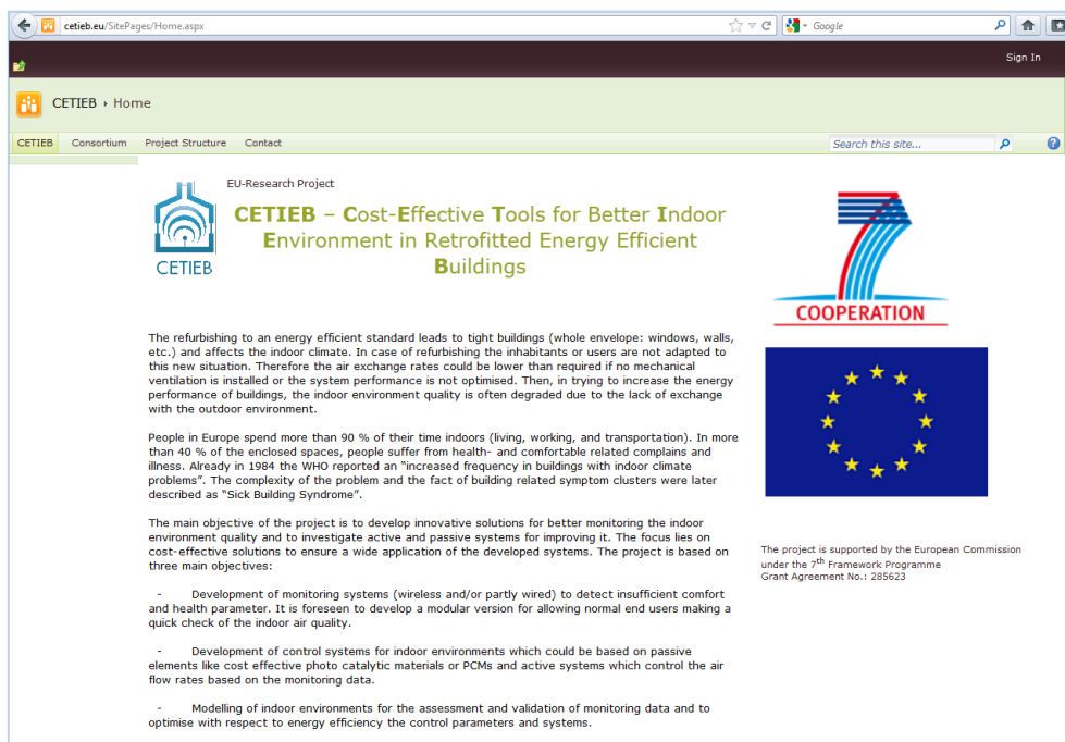
Figure 1: CETIEB website - Home

The website was generated by the use of Windows SharePoint [1] and is running at the server of MPA University of Stuttgart under http://cetieb.eu [2]. It is reachable as well by www.cetieb.eu .