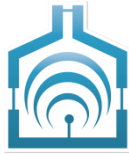
Figure 2: Logo

As part of the awareness material also the project logo is included here.